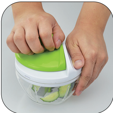
Slip the operator on the lid to rotate the blade