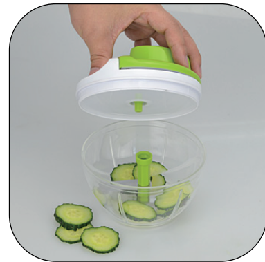
Put the lid on the bowl