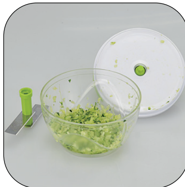
Chopping job finished.