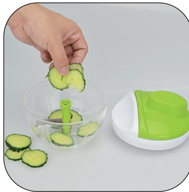
Put vegetable or fruit into the bowl