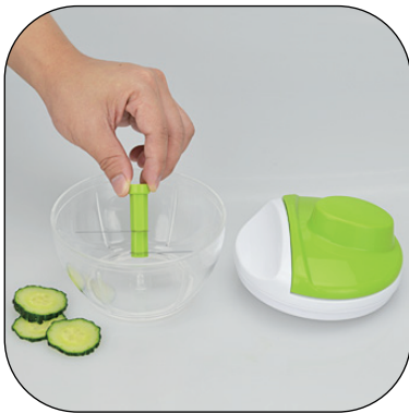
Fit the blade on